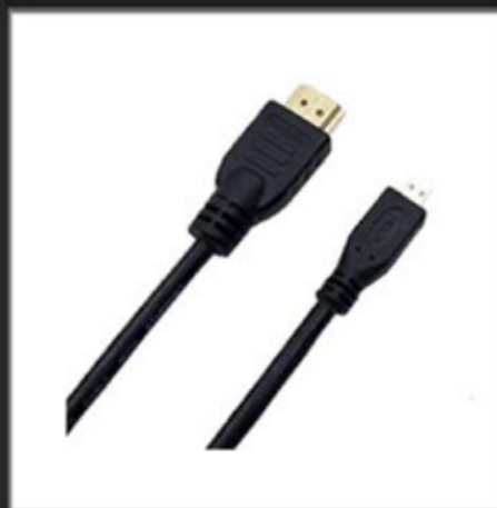
0.8M HDMI A-D Cable