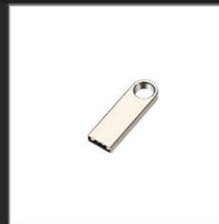
USB Drive Disk