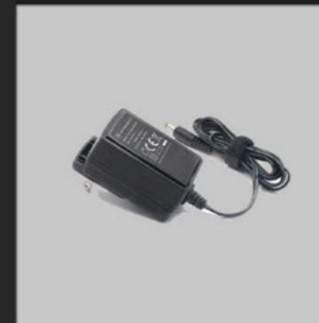
12V 2A DC Power Adapter