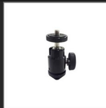
Hot Shoe Mount